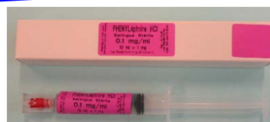
Fig 3. Ready-to-use syringes

Only two-third of syringes prepared in an operating theatre have concentrations corresponding to the European pharmacopoeia requirements. In 8% of cases, the dosage is far away from the expected concentration, suggesting not only an imprecision, but an error during drug preparation. These results strongly support the need for strict preparation procedures (i.e. preparation protocols) and the production of ready-to-use syringes in GMP conditions at the pharmacy (Fig. 3).